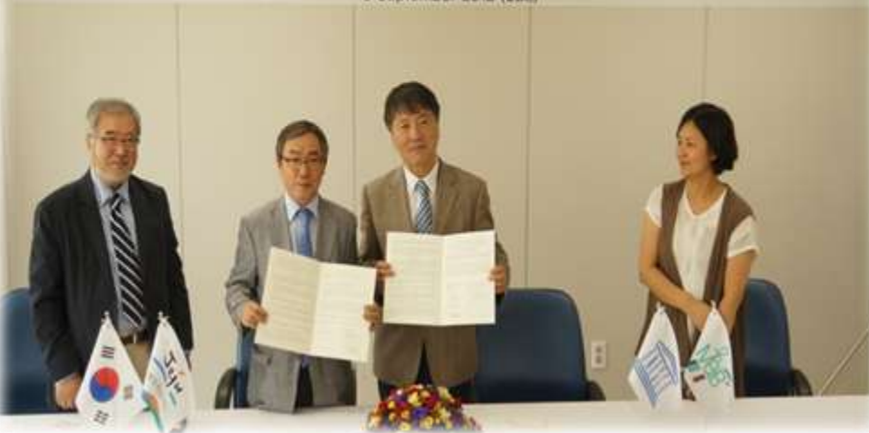
Jeju Jeju Special Self-Governing Province -- UNESCO Fund-in-Trust Signing Ceremony for the Global Network of Island and Coastal Biosphere Reserves 8 September 2012 (Sat.)